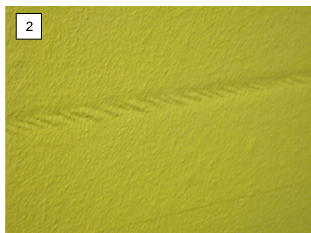
Photos 1 and 2: racking test set-up is depicted in photo 1 while joint under stress is depicted in photo 2. As with many of the tests identified in ICC AC 212 and the Canadian Technical Guides for air barriers and liquid applied WRBs (sheathing membranes), resistance to water penetration is evaluated after stress or fatigue tests.