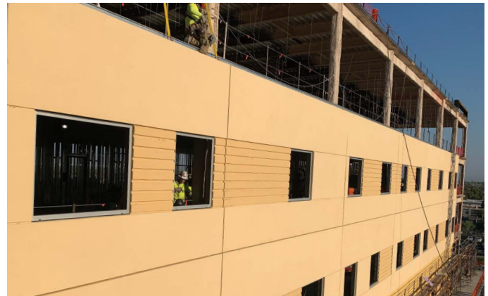
Window receptors and sealants are pre-installed in a controlled factory setting prior to delivering the panels to the jobsite.