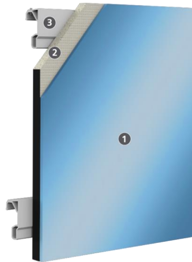
Sto Ventec Glass Panel Assembly: Sto opaque glass (1) fully bonded to 20mm Sto Carrier Board A+ (2) with StoVentec® Panel Profile (3)