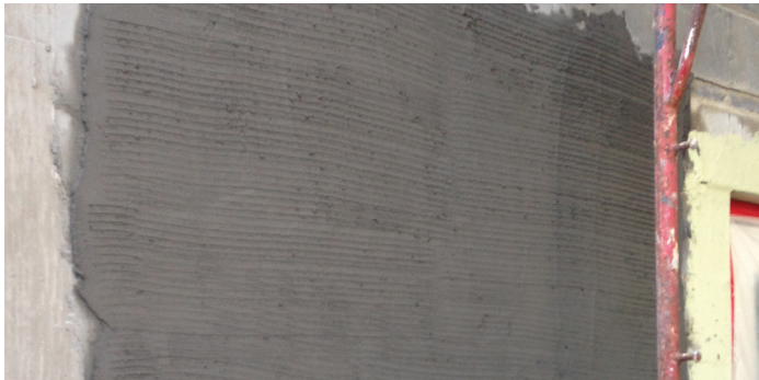
Sto Wall Leveler & Patch is the ideal solution to level and patch small or large areas.

There is a right way and a wrong way to do every project. Adding more stucco may seem like an easy solution for a wall that isn't flat or out of alignment. But according to ASTM C926, the maximum thickness for stucco is 5/8". Sto Wall Leveler & Patch helps you get the substrate into compliance the proper way. It's compatible with all stuccos and greatly reduces the risk of future delamination.