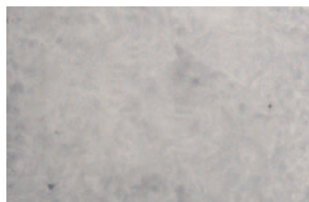
#106ST - Cortono