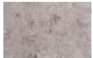
#107ST - Sestino