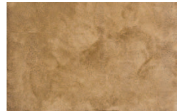
#103ST - Pumbino