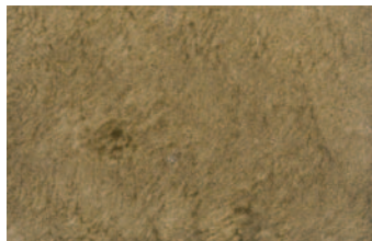
#109ST - Uzzano