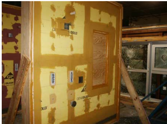
Figure 1. ASTM E 2357 test panel with penetration and transition details.

includes transition details to adjacent framing and a concrete foundation or slab.