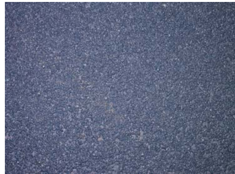
Wal-Mart Blue (dark color)

Figure 1 below illustrates a dramatic difference in fading between 130D Stolit and a competitive EIFS textured finish as well as improved physical performance.