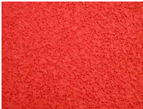
Wal-Mart Red (vibrant color)

Dark or vibrant color textured finishes are sometimes specified over EIFS, stucco, concrete, and masonry substrates. 130D Stolit is a superior product formulation for these type colors especially when considering resistance to fading. It should be used in lieu of 130 Stolit, 310 Essence, 136 StoSilco Lit, or any fine textured competitive finish. Examples of colors where 130D Stolit should be used are Wal-Mart Red and Blue. These and similar dark or vibrant colors typically must use organic colorants to obtain the desired color. Unfortunately organic colorants are more prone to fading than colors that use inorganic colorants. To optimize resistance to fading for these and similar vibrant colors Sto Corp. developed 130D Stolit.